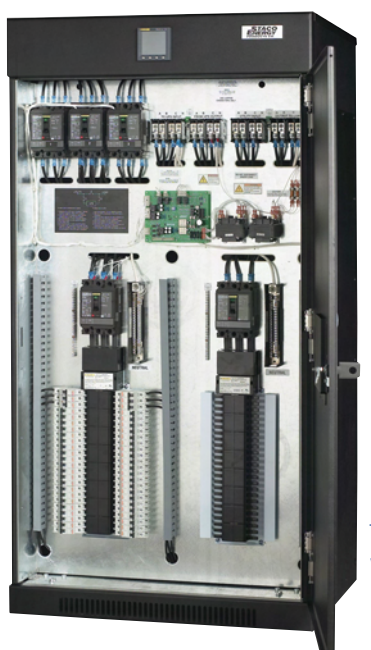
Full Two Year Warranty